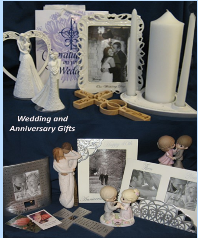
Wedding and Anniversary Gifts

MOSACK'S has a wide selection of Wedding and Anniversary Gifts to highlight your special day. Choose from our selection of Unity Candles, Crosses, Frames, Precious Moment Figurines, Music Boxes and more. Personalize your selection by adding a name, date and/or a special message.